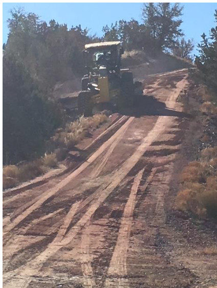
Roadwork: Grader fixing the entry hill

There is over a mile of dirt road which leads to the church property. Use of the road over the past seven years, has led to serious deterioration. At times, when it rains or snows, the road has been impassable to all but four-wheel drive vehicles.