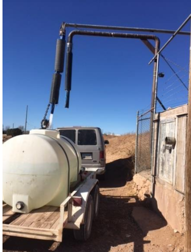
Roadwork: Filling the water trailer

Our property is not near to any kind of municipal services, so our water is provided by our own well and then pumped up from the well to a holding tank. We found over the past few years that having just one holding tank of 2,600 gallons was not sufficient during times of high water use. We therefore purchased an additional 2,760 gallon tank from Loomis Tanks.