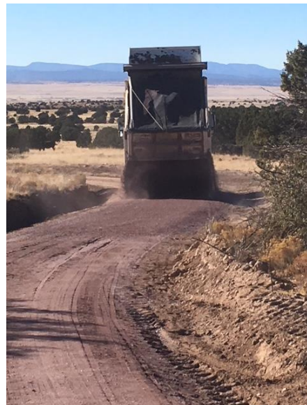
Roadwork: Dump Truck