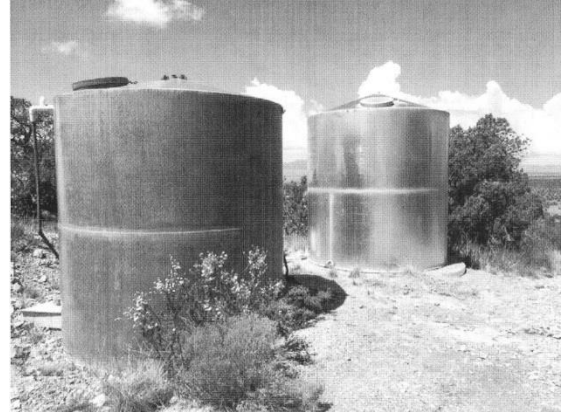
Second water tank

There is over a mile of dirt road which leads to the church property. Use of the road over the past seven years, has led to serious deterioration. At times, when it rains or snows, the road has been impassable to all but four-wheel drive vehicles.