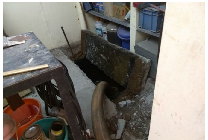
Schaffung eines Zugangs zum Abwassertank und Abpumpen des Inhalts