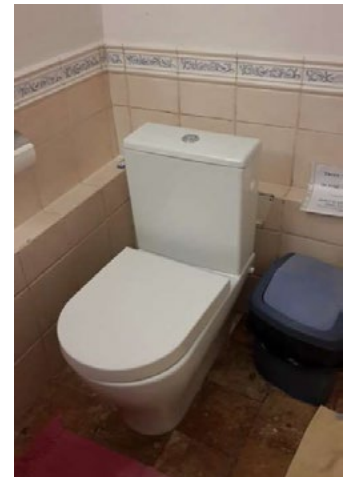
Bathroom little house