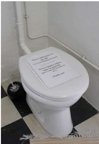
Ground floor – Big house