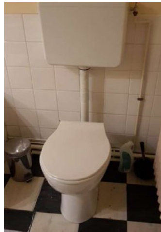
2nd floor – Big house–North Bathroom