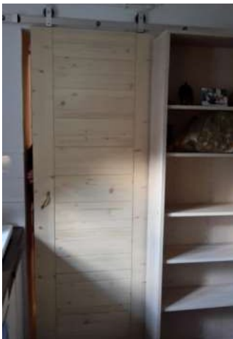
Sliding entry door of the room