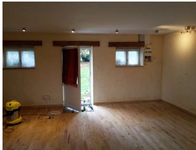
Entry door from outside + lighting