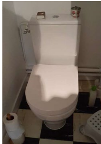
Second floor – Big house - Upstairs